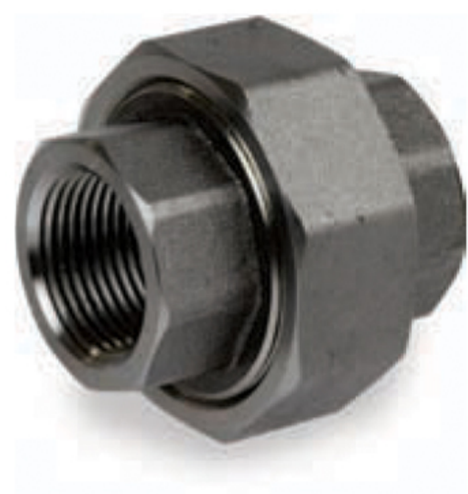
Fig. 42U 3 – Union